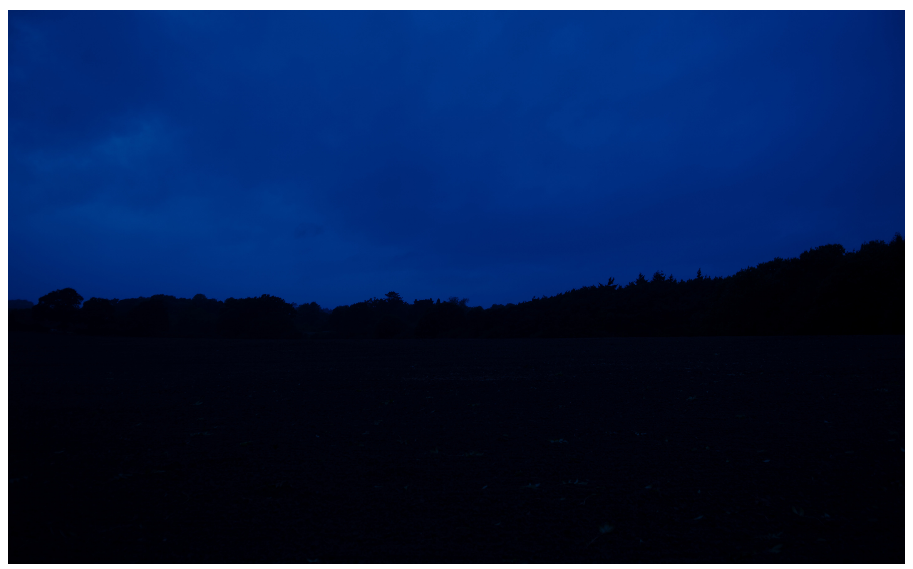
EXISTING NIGHT TIME VIEW