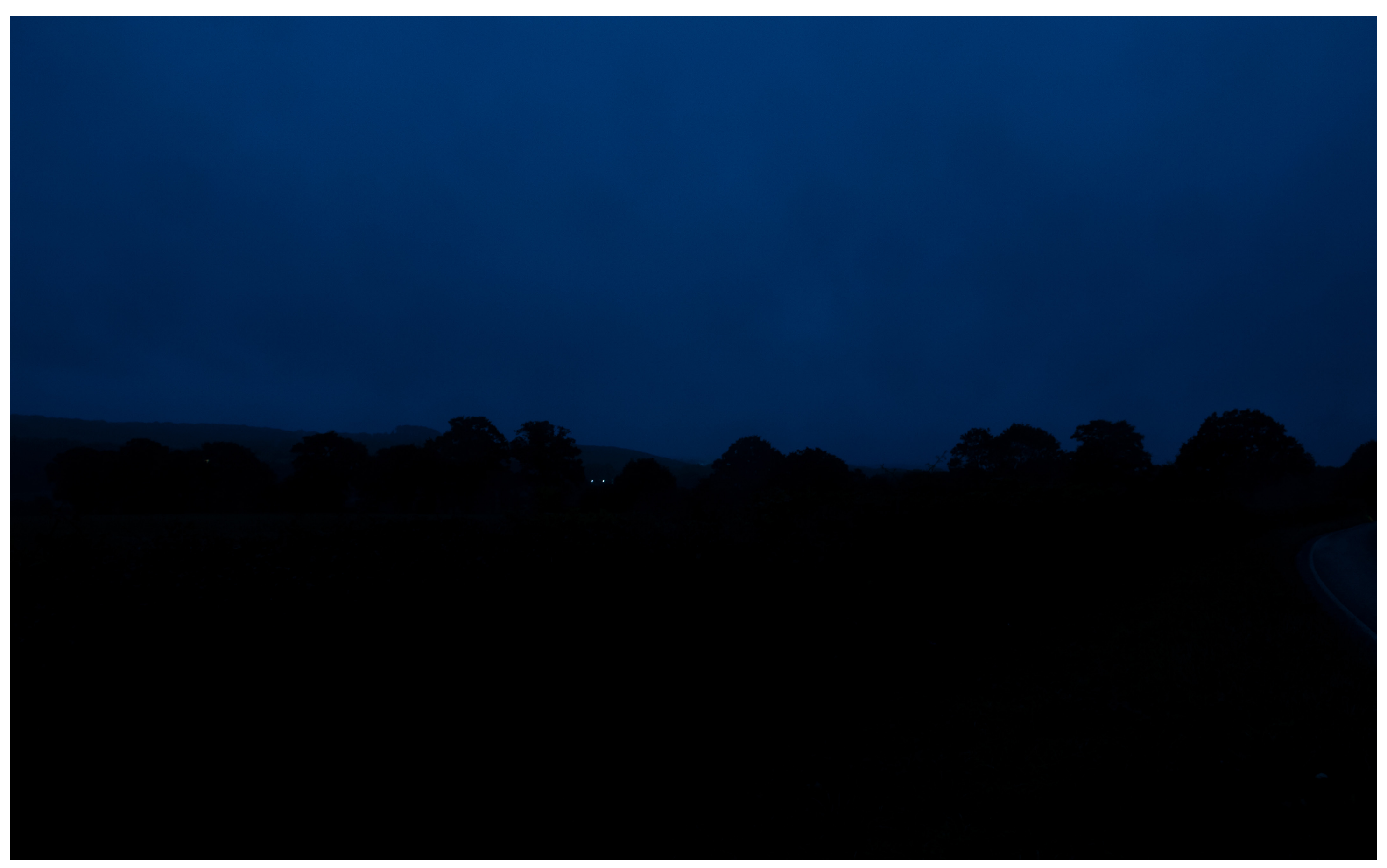
EXISTING NIGHT TIME VIEW