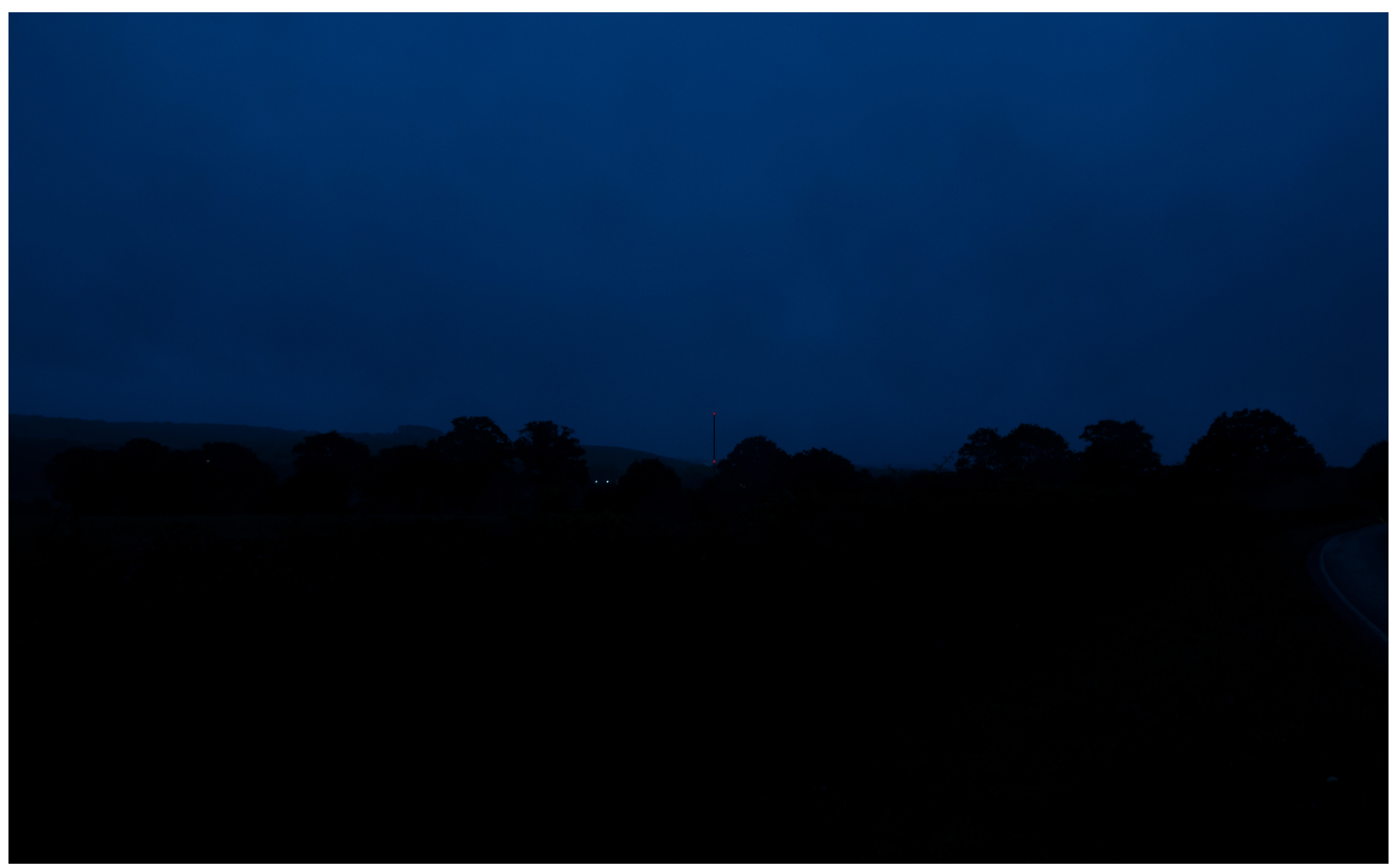
PROPOSED NIGHT TIME VIEW