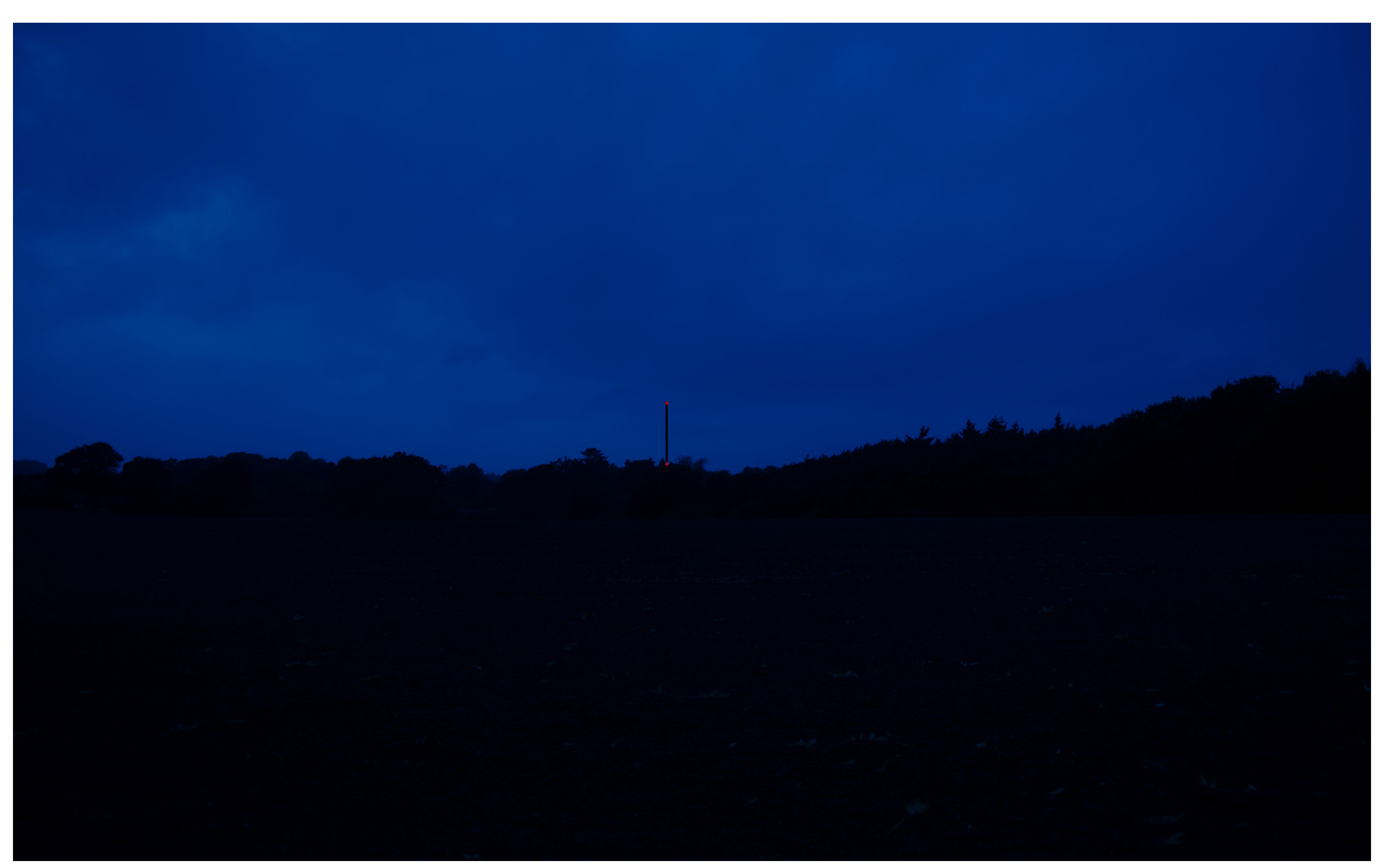
PROPOSED NIGHT TIME VIEW