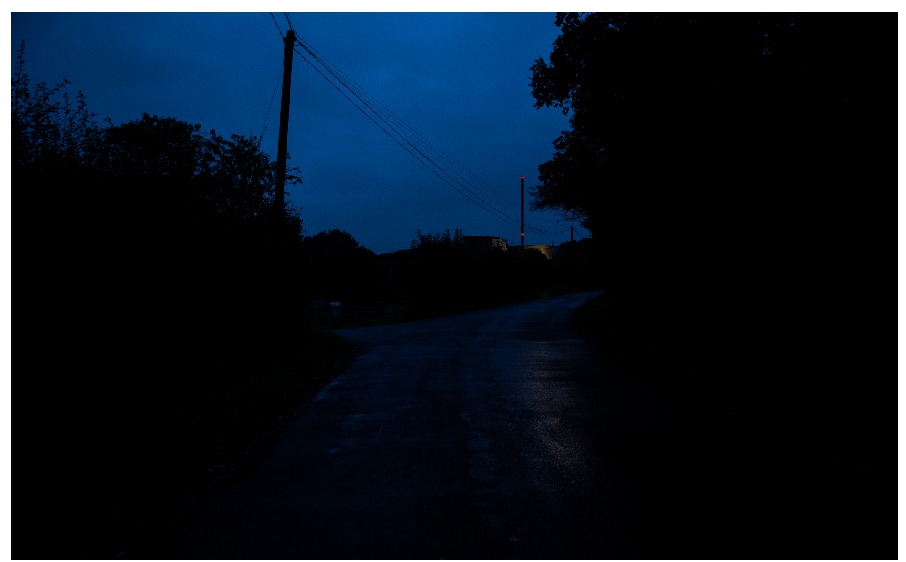
PROPOSED NIGHT TIME VIEW