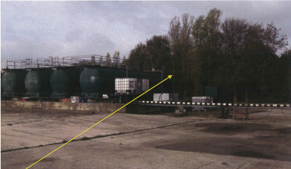
5, 6 Vent stack