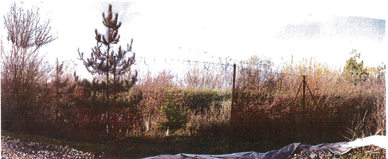
Figure 2. Panoramic view of planted area