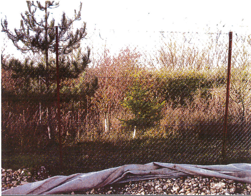
Figure 1. Planting