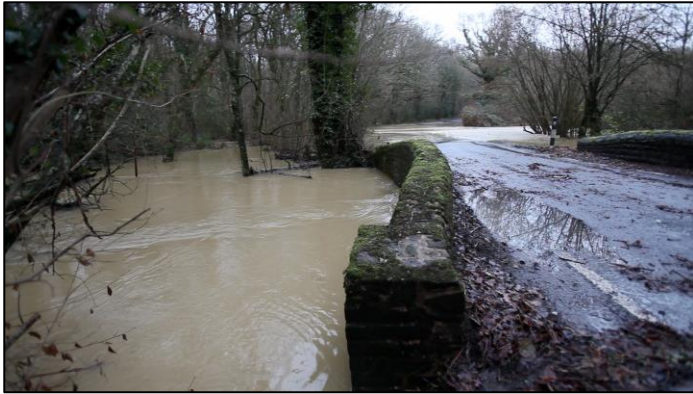
Boxal Brook in flood. With heavy rain and flood conditions this road is impassable to cars.