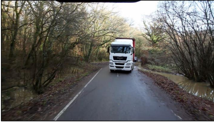
Boxal Bridge – single carriageway.