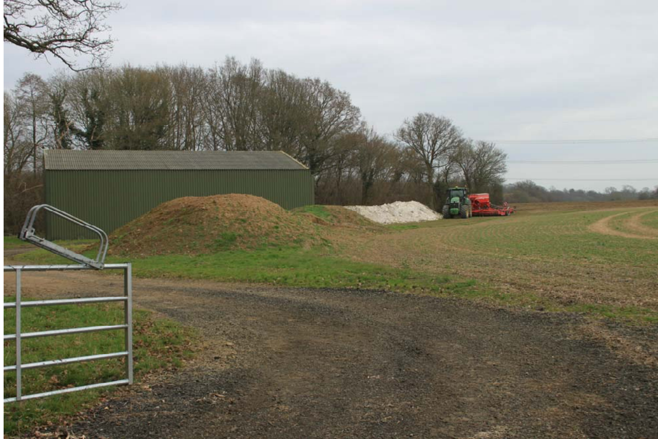
View towards Site - Existing