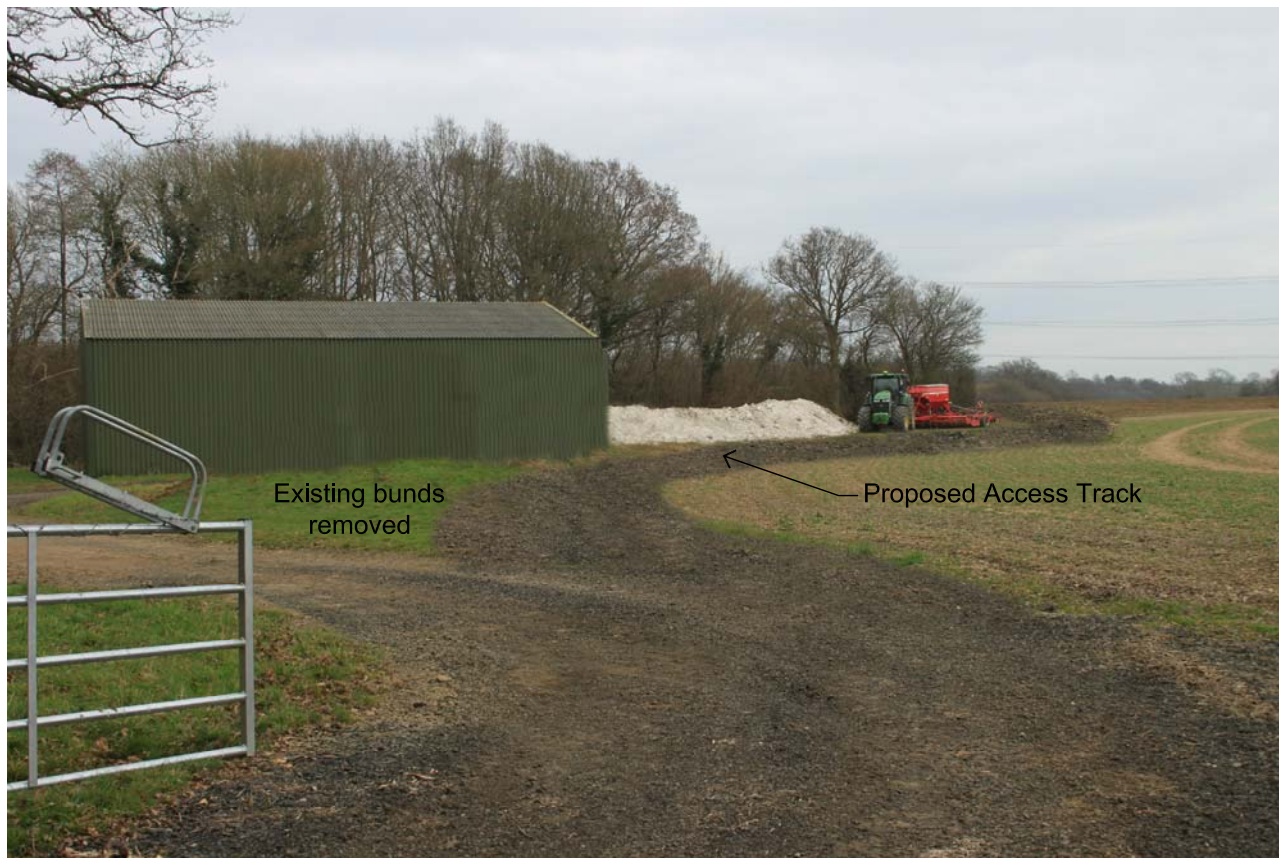
View towards Site - Proposed (Construction Phase)