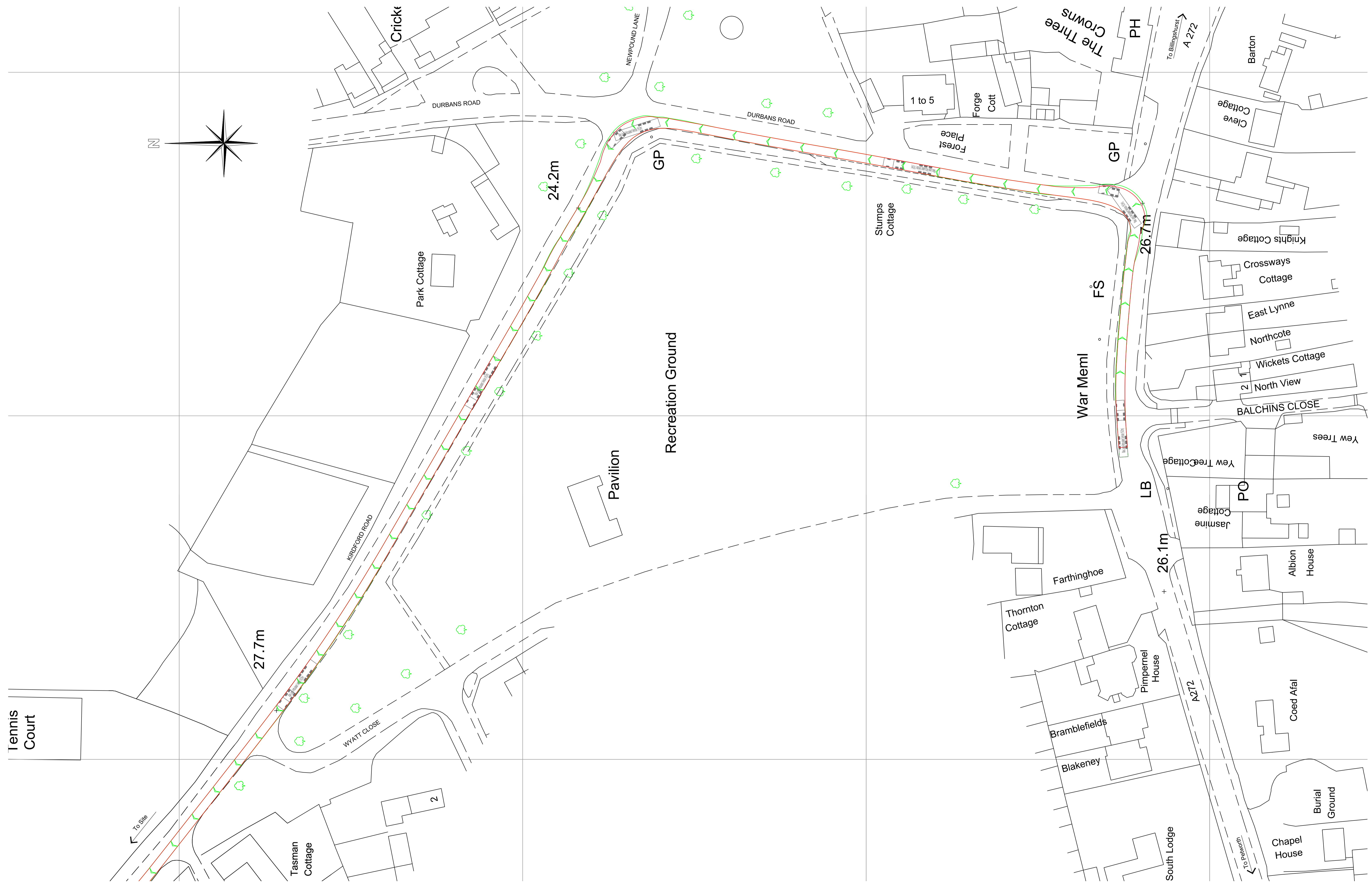
HGV Swept Path through Wisborough Green (to Site) Scale 1:500