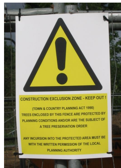
Figure 2 - Example of suitable warning sign affixed to protective barrier