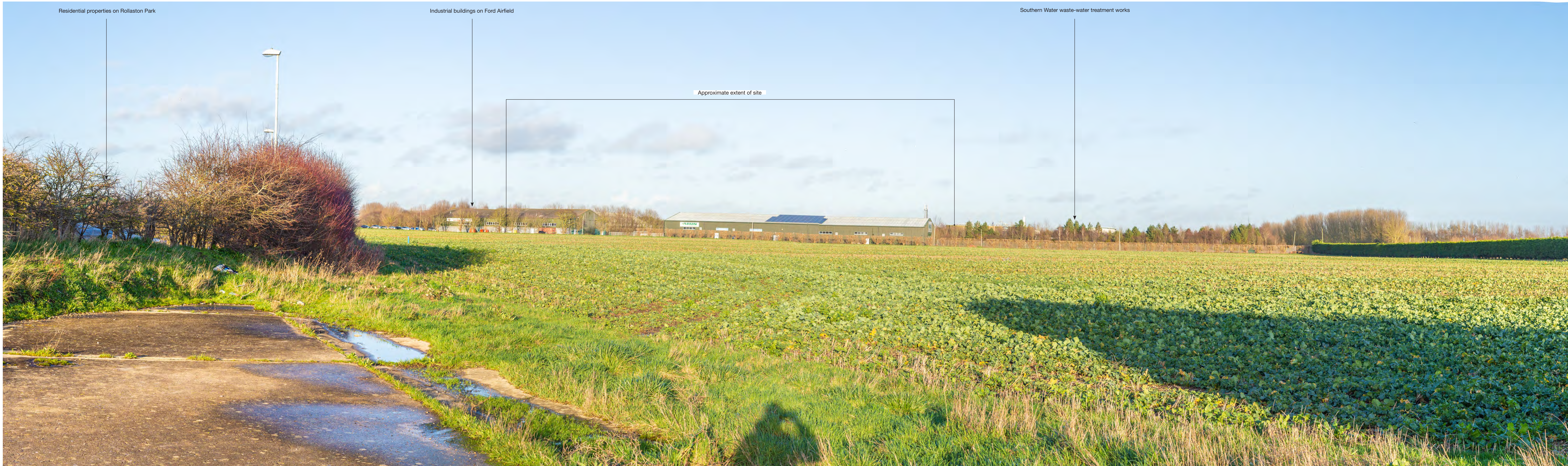
Viewpoint 16 from PROW Ford 175-1 looking north east toward site Representative viewpoint photograph. To be viewed at a comfortable arm's length and printed at A1