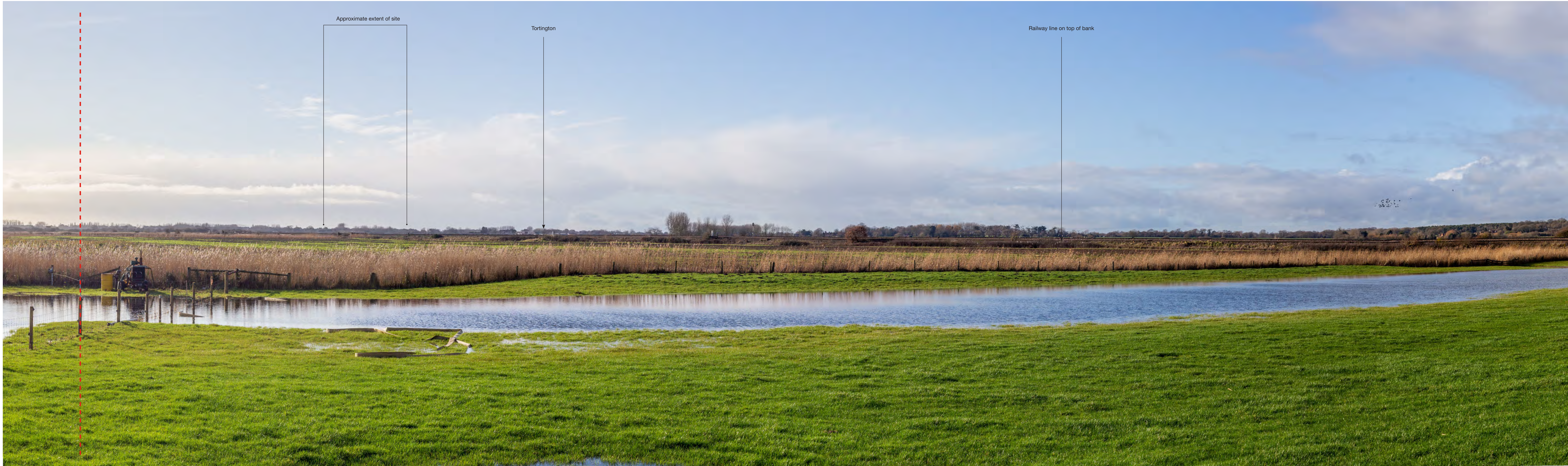
Viewpoint 12 from PROW Lyminster and Crossbush 2207-1 looking west toward site (continued) Representative viewpoint photograph. To be viewed at a comfortable arm's length and printed at A1