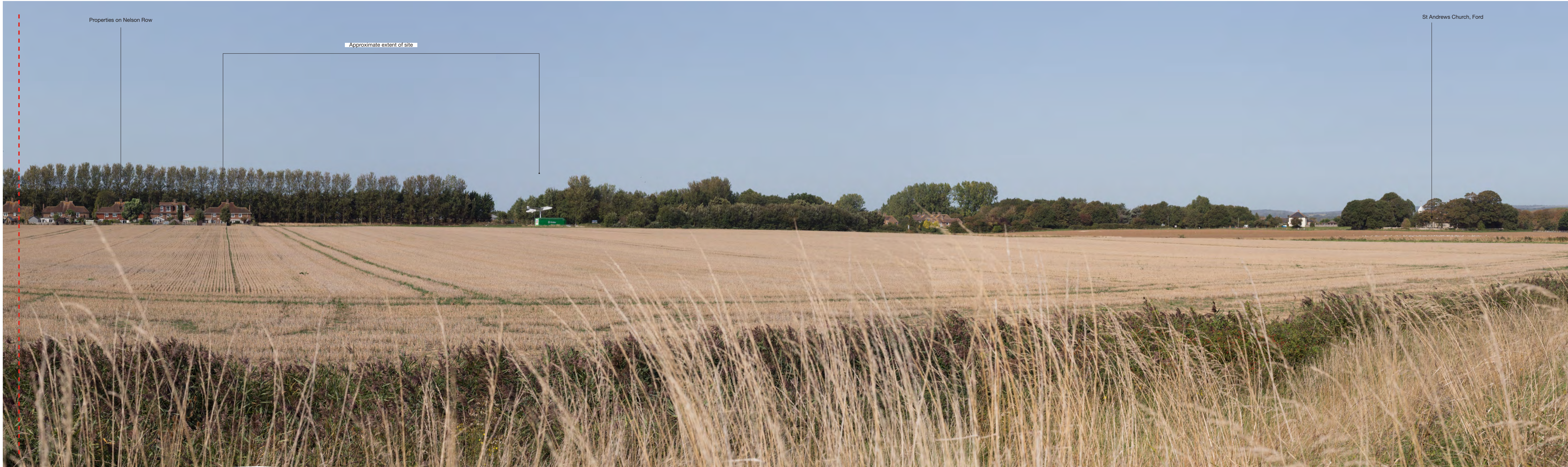
Viewpoint 14 from PROW Ford 206-7 looking west toward site (continued) Representative viewpoint photograph. To be viewed at a comfortable arm's length and printed at A1