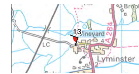
Figure 12.30 Representative viewpoint 13 Lyminster village edge