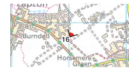
Figure 12.33 Representative viewpoint 16 Ford Airfield PROW