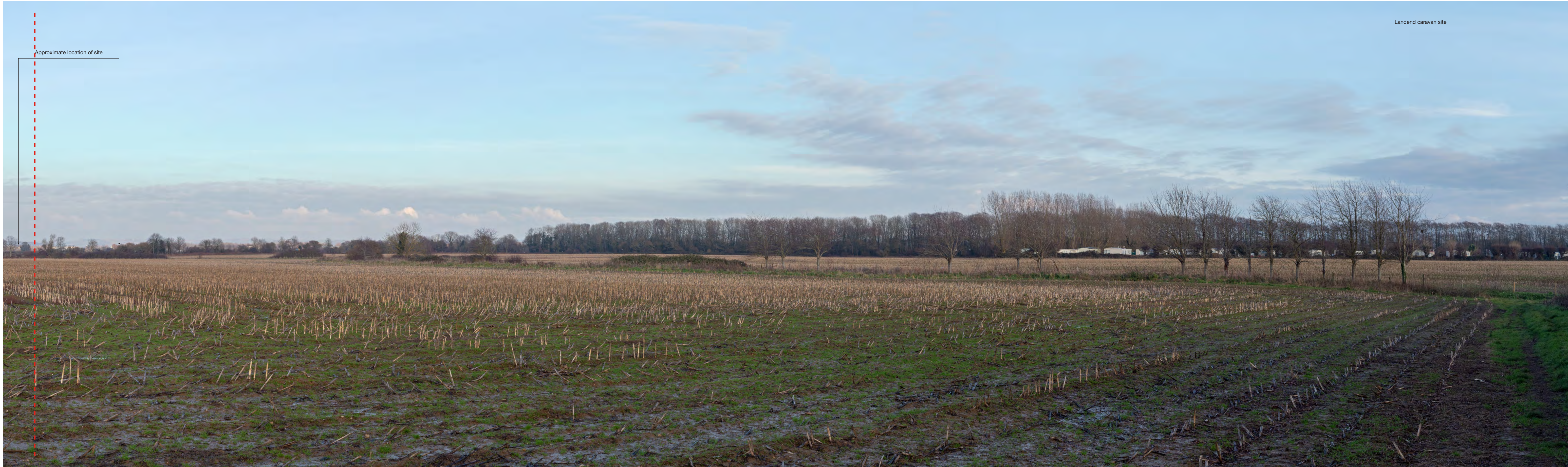
Viewpoint 17 from PROW Middleton-On-Sea 2997-1 looking north east toward site (continued) Representative viewpoint photograph. To be viewed at a comfortable arm's length and printed at A1