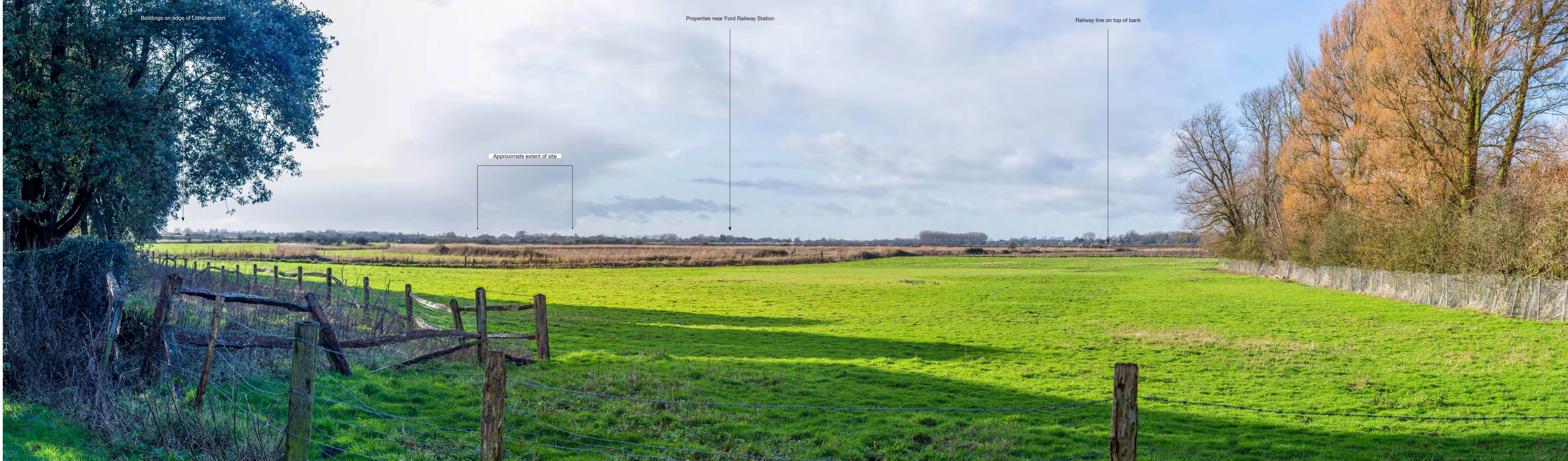
Viewpoint 13 from PROW Lyminster and Crossbush 2207-1 looking west toward site Representative viewpoint photograph. To be viewed at a comfortable arm's length and printed at A1