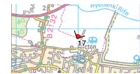
Figure 12.34 (continued) Representative viewpoint 17 North edge of Middleton-on-Sea