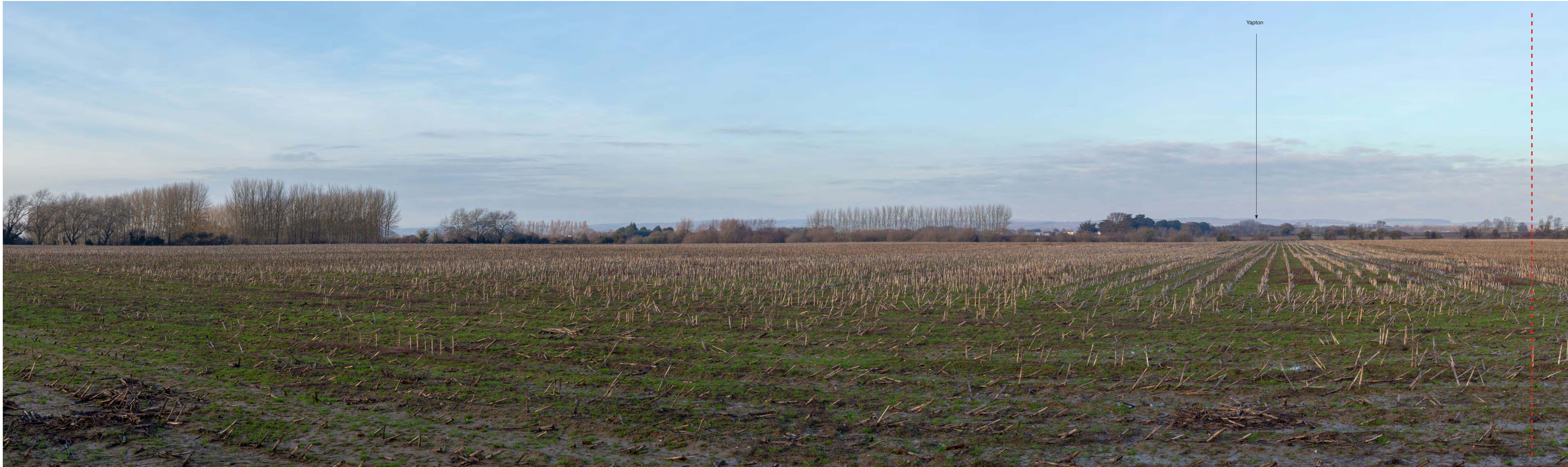
Viewpoint 17 from PROW Middleton-On-Sea 2997-1 looking north east toward site Representative viewpoint photograph. To be viewed at a comfortable arm's length and printed at A1