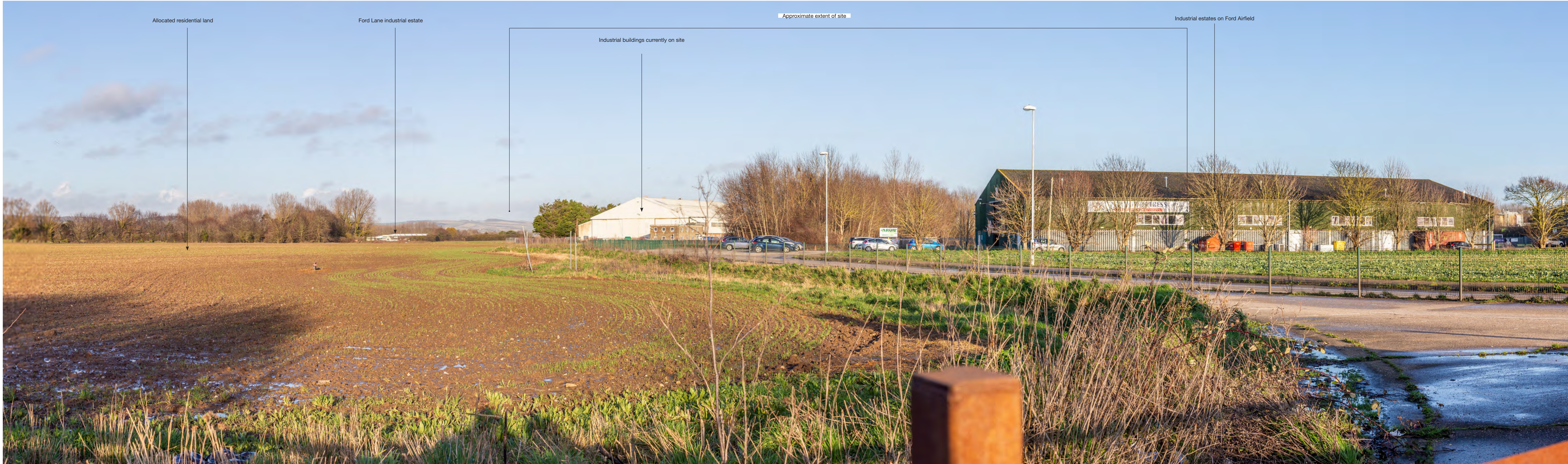
Viewpoint 15 from Rollaston Park looking east toward site Representative viewpoint photograph. To be viewed at a comfortable arm's length and printed at A1