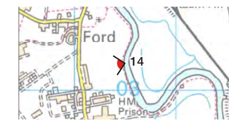
Figure 12.31 (continued) Representative viewpoint 14 River Arun