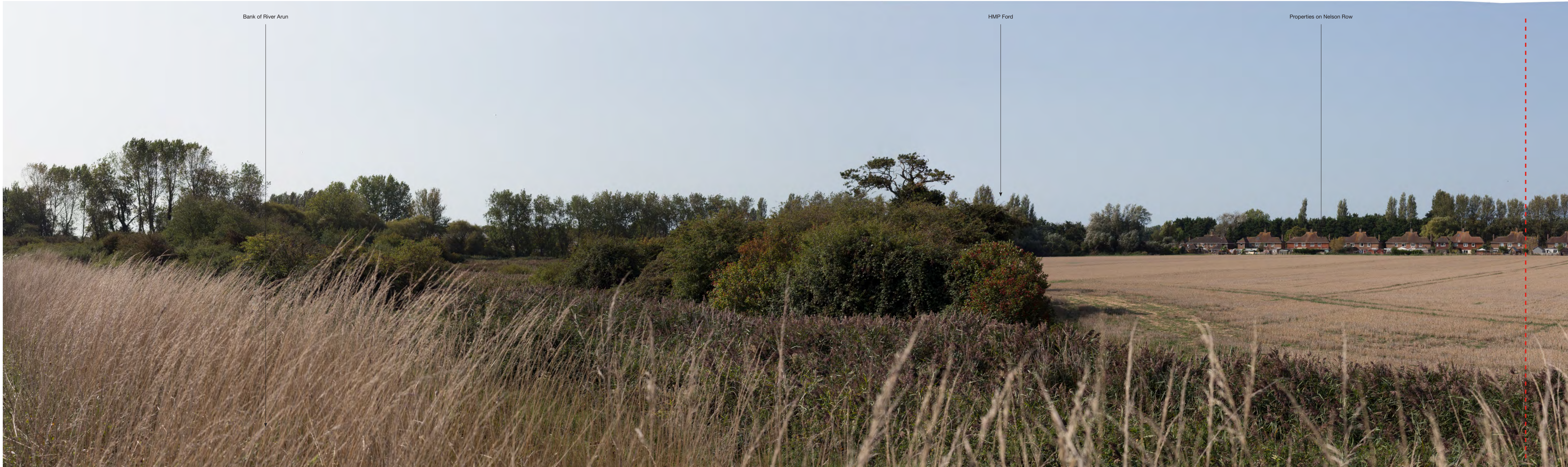
Viewpoint 14 from PROW Ford 206-7 looking west toward site Representative viewpoint photograph. To be viewed at a comfortable arm's length and printed at A1