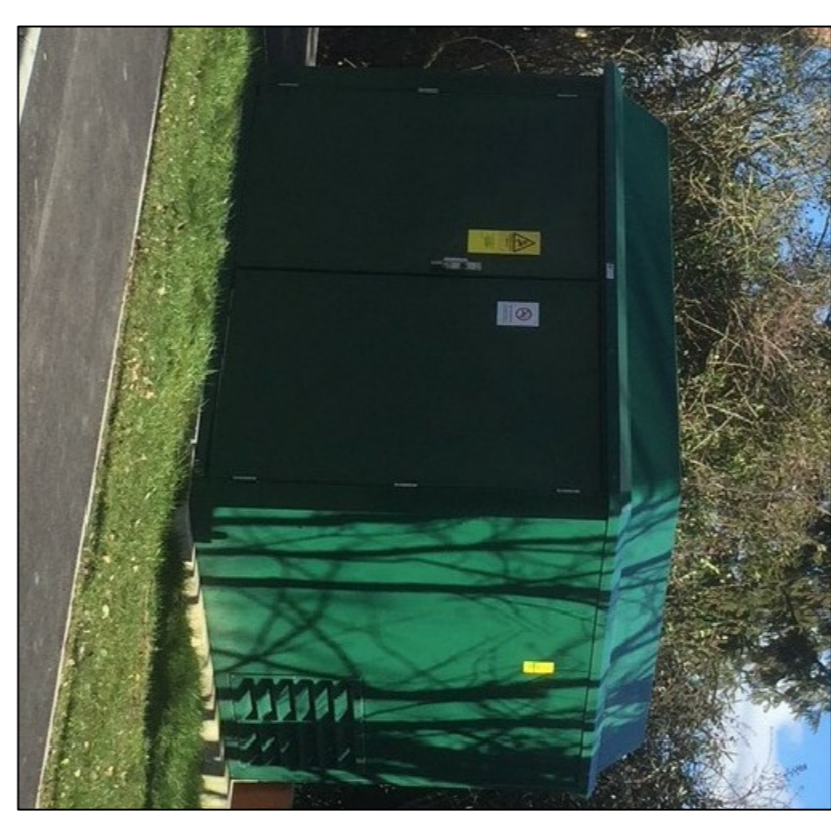
EXAMPLE IMAGE SHOWING PROPOSED TRANSFORMER HOUSING KIOSK