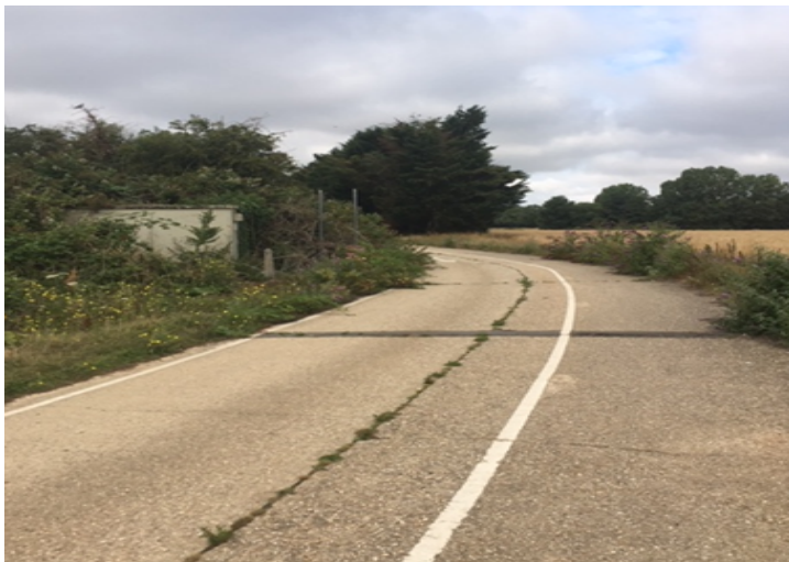
Line of Footpath 200_3 heading West before turning North.