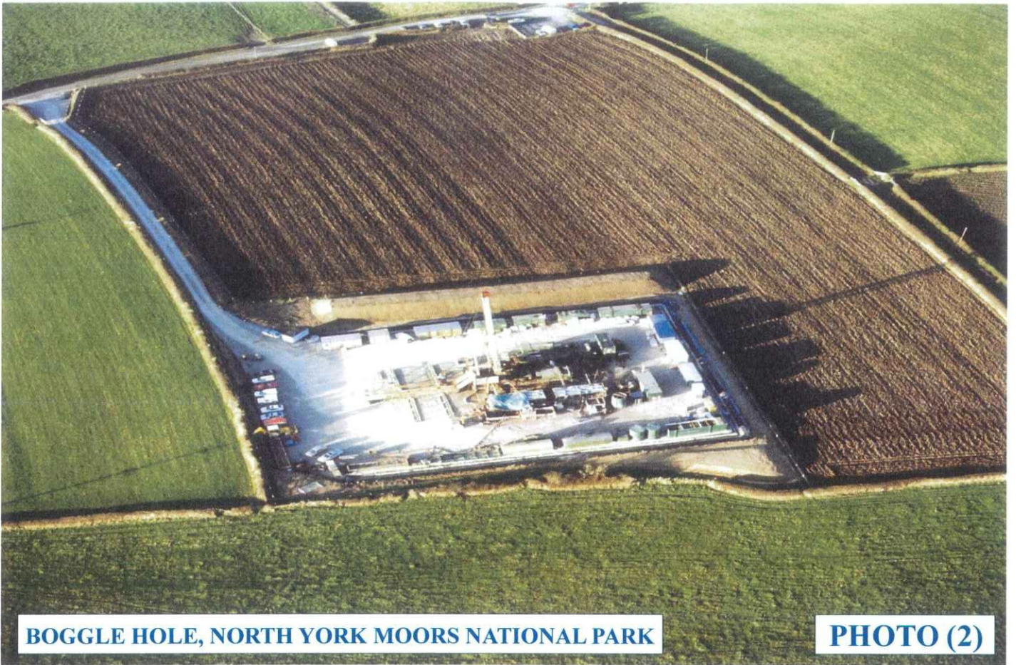
BOGGLE HOLE, NORTH YORK MOORS NATIONAL PARK