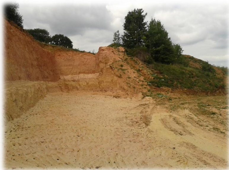
Figure 2 Western Extent of Excavation

The base of the excavation extends to a deeper level when compared adjacent areas, particularly to the east where existing cut sand faces are present.