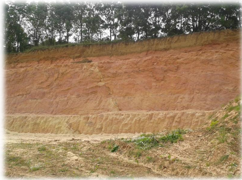
Figure 1 Excavated Sand Face

At its western edge of the excavation the face has been extended into a deeper wedge of in-situ sands, where the inner material has been retained. This appears to have been carried out to allow an area of vegetation to be retained.