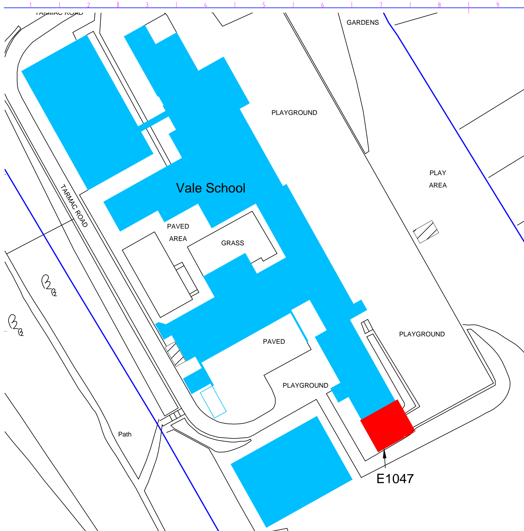
SITE PLAN scale 1/500