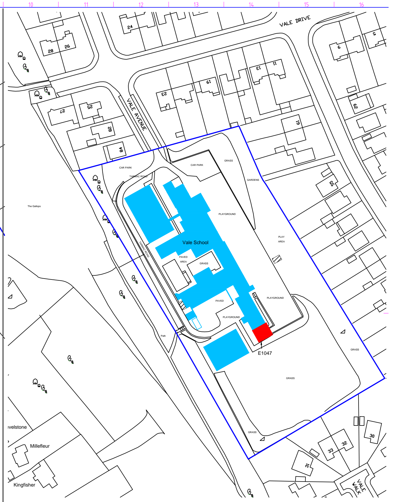
LOCATION PLAN scale 1/1250

This map is based upon or reproduced from Ordnance Survey material with the permission of Ordnance Survey on behalf of the Controller of Her Majesty's Stationery Office © Crown copyright reserved. Unauthorised reproduction infringes Crown copyright and may lead to prosecution or civil proceedings. West Sussex County Council Licence 100018485 2003.