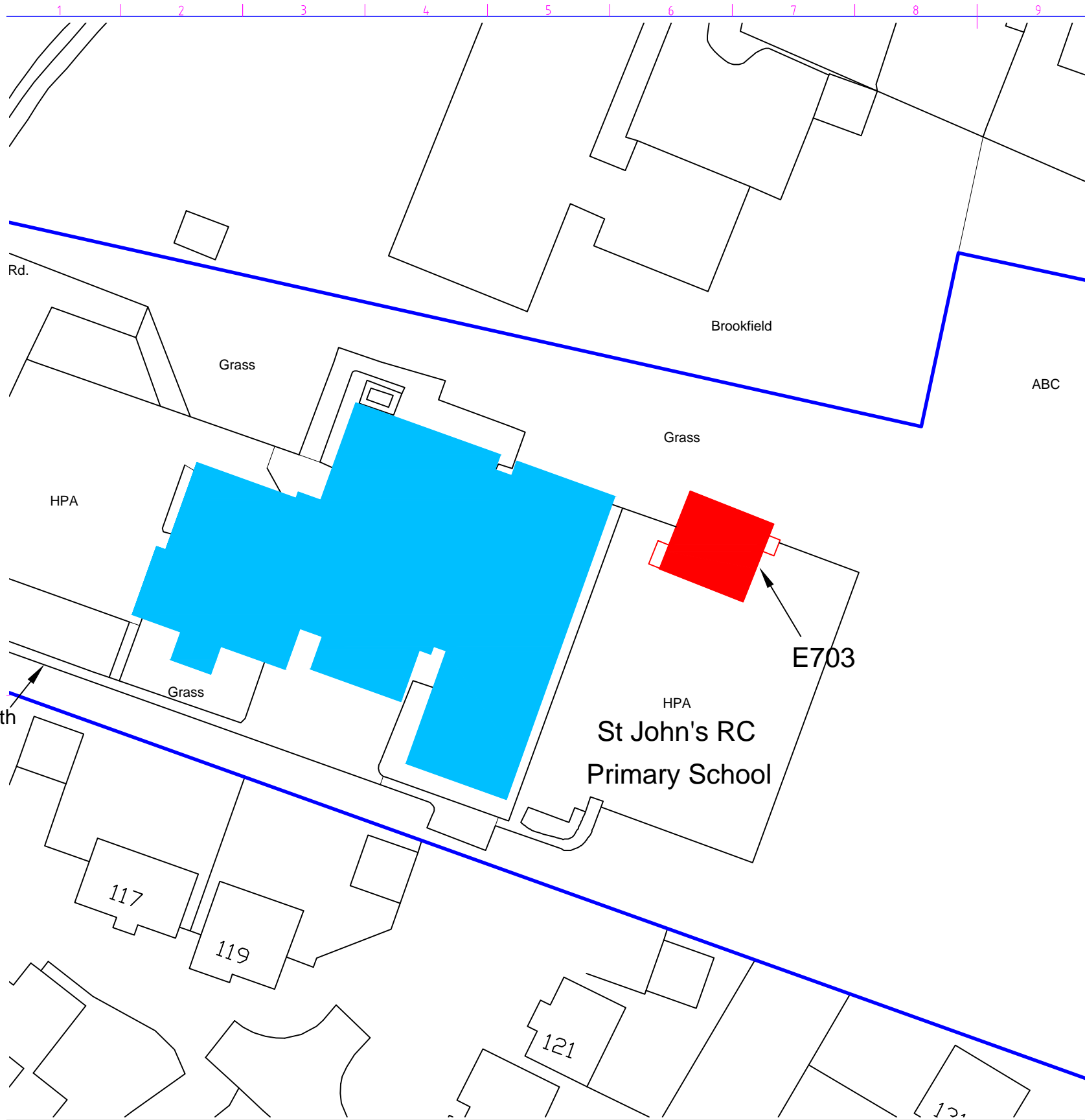
SITE PLAN scale 1/500