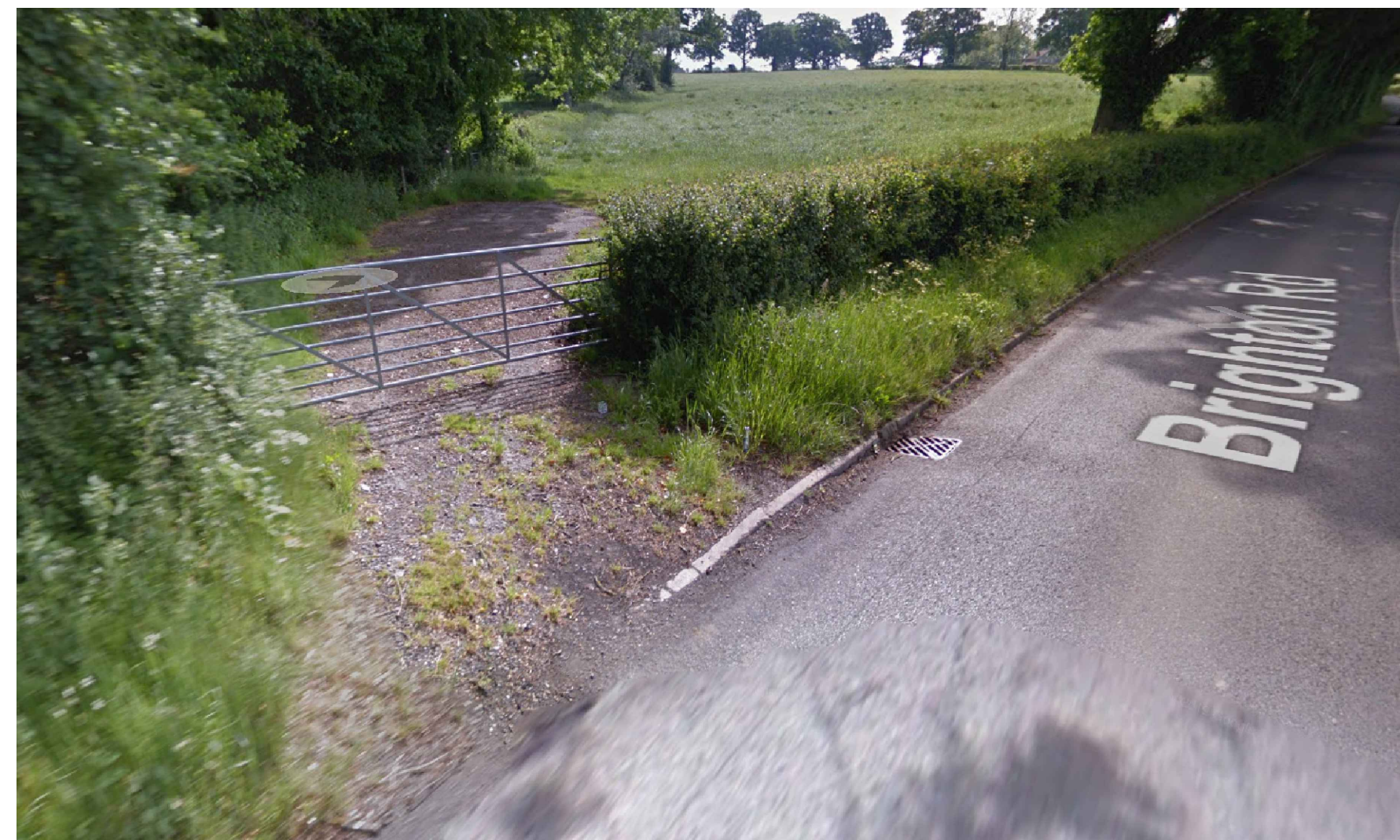
EXISTING UMMADE ACCESS