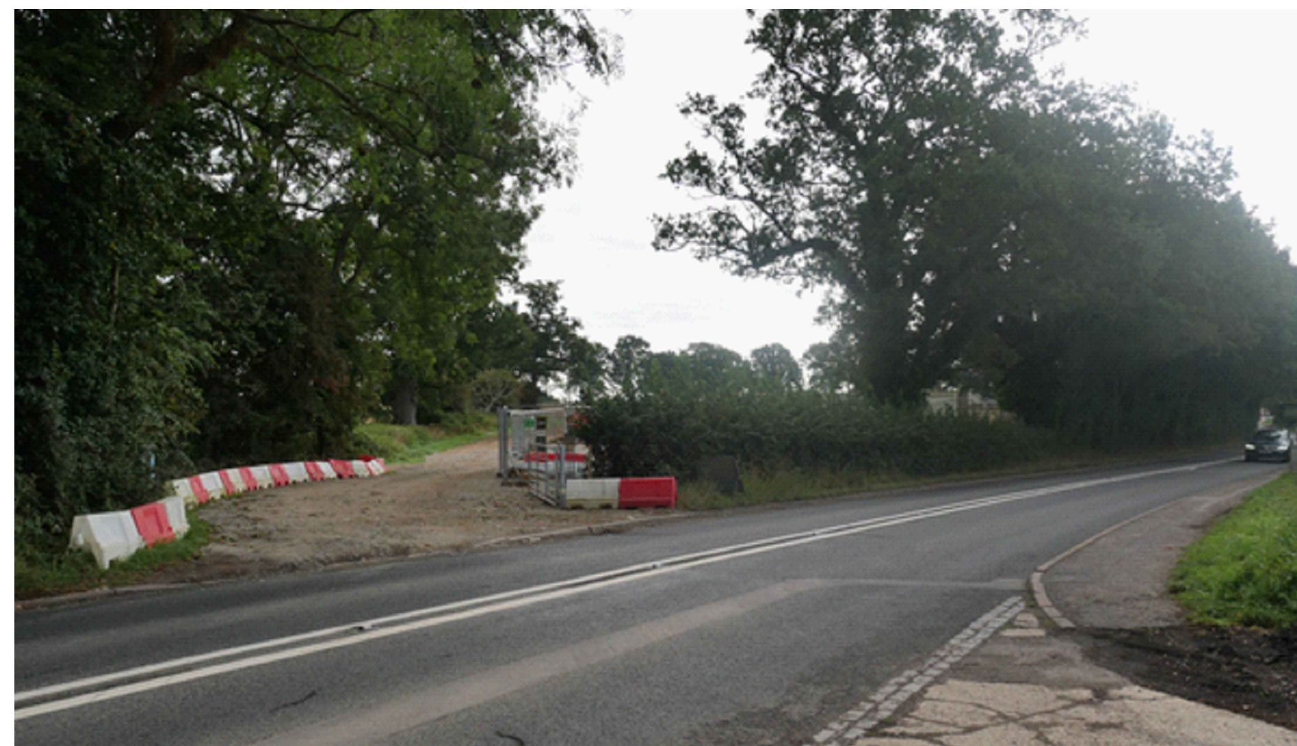
TEMPORARY SITE ACCESS

NOTE: UPON COMPLETION OF THE WORKS, THE FARM ACCESS IS TO BE REINSTATED