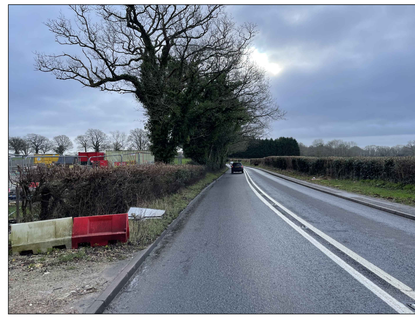
IMAGE 2 - VIEW FROM CENTER OF LEFT LANE