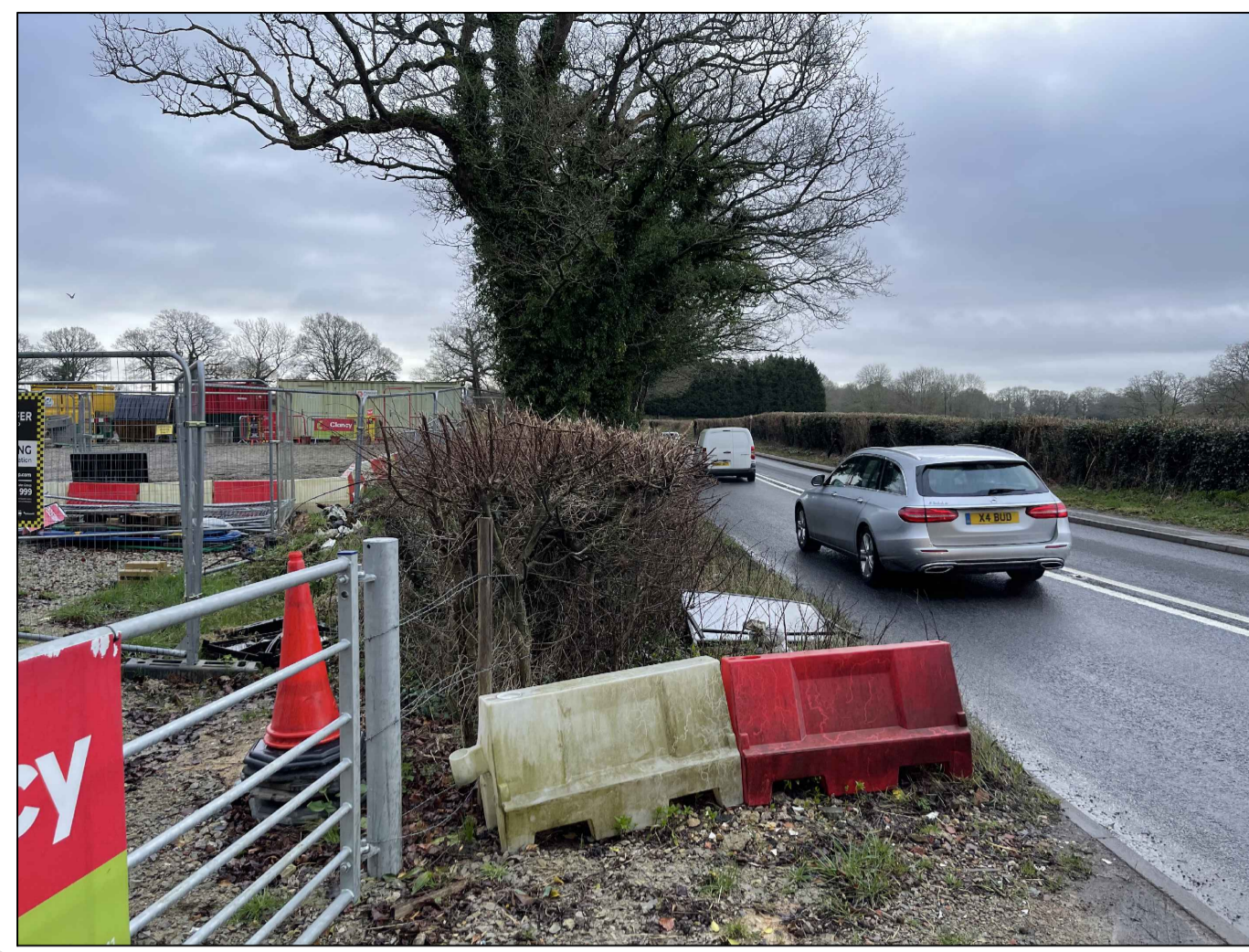
IMAGE 1 - VIEW FROM LEFT HAND SIDE OF ACCESS