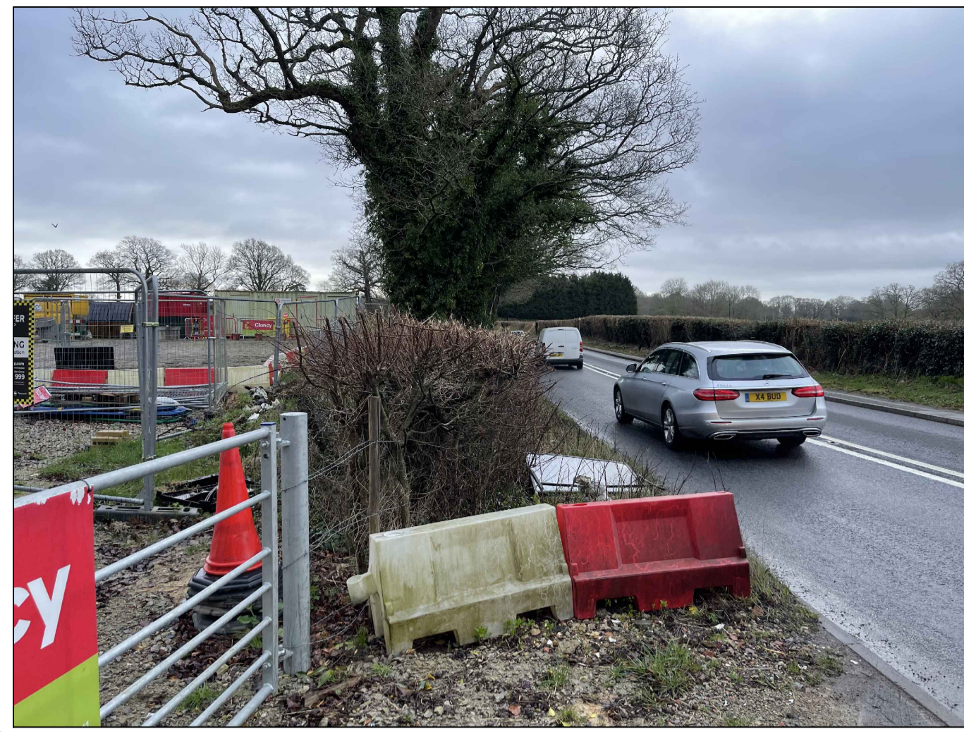
IMAGE 1 - VIEW FROM LEFT HAND SIDE OF ACCESS