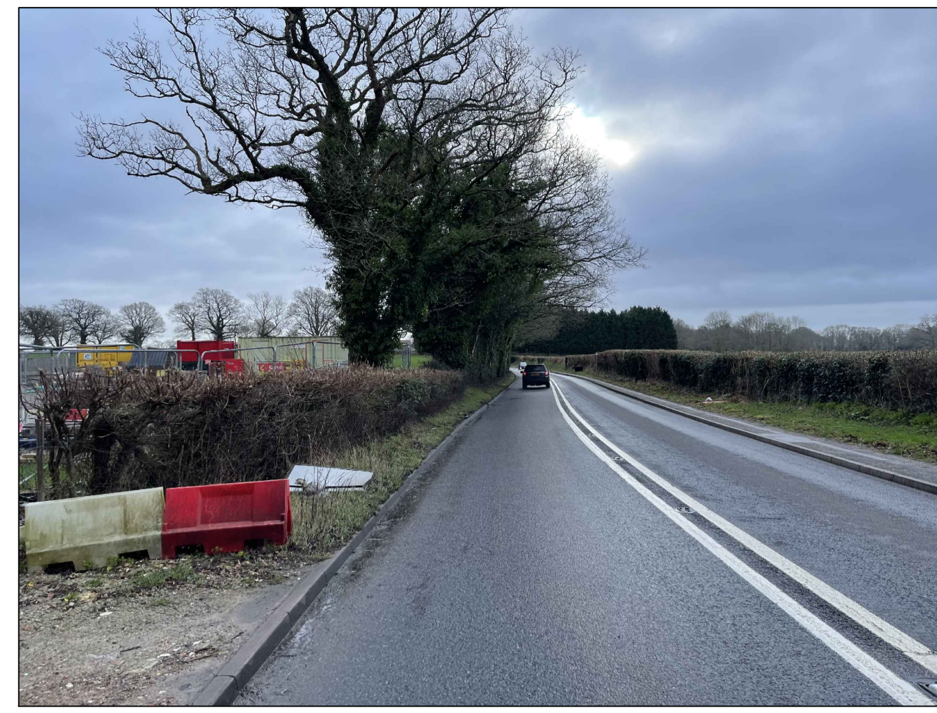
IMAGE 2 - VIEW FROM CENTER OF LEFT LANE